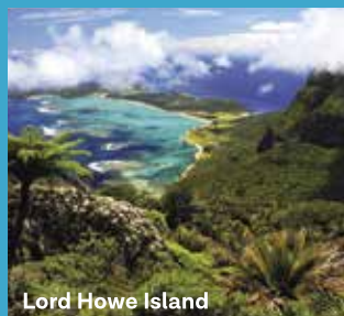
Lord Howe Island