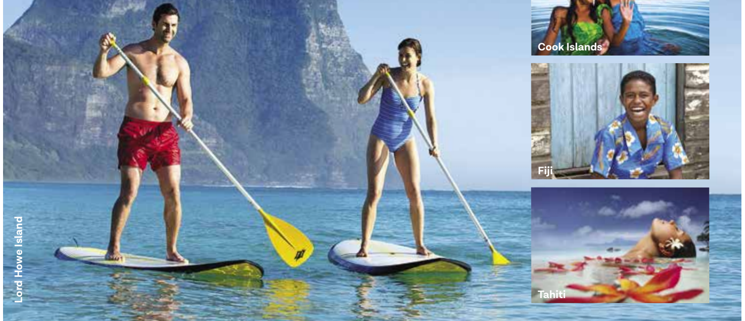
Lord Howe Island

Omniche Holidays - Exotic South Pacific. Expertly Packaged 2020