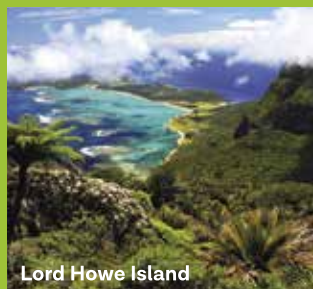
Lord Howe Island