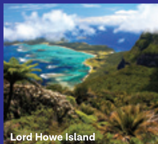
Lord Howe Island