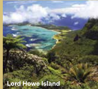
Lord Howe Island