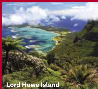
Lord Howe Island