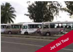
Jet Ski Tour

This tour takes you to the Famous Mele Cascades & Waterfall. Guests are greeted by one of Evergreen's friendly & knowledgeable guides at your Port Vila accommodation and the tour starts straight away. Enjoy a pleasant drive just out of town past Mele Village and our guide will provide commentary on the 15 min transfer to the entrance of Mele Cascades & Waterfall. Enjoy a guided tour through the lush & tropical rainforest where you will be able to catch sight of local cultivation of vegetable gardens and learn about the culture and livelihood of the local people. Go for a dip in the clear natural rock pools for a refreshing swim or you can simply relax and enjoy the green scenery. At the base you will find an array of tropical seasonal fruits and cold drinks awaiting your descend it is served on the Mele Cascades overwater deck. Soft Drinks, Alcohol Beverages and snacks can be purchased from the Pool Bar.